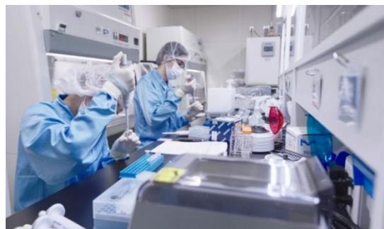
Teijin Regenet "Iwakuni Factory"